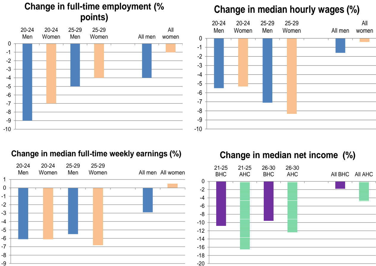
Figure 3: Changes in economic outcomes, selected ages, various years

Note: Employment is percentage point change 2006-2008 to 2010; Wages and earnings are real percentage change 2006-2008 to 2010; Household incomes are real percentage change 2007-08 to 2010-11. BHC is before housing costs; AHC is after housing costs. All figures for UK.