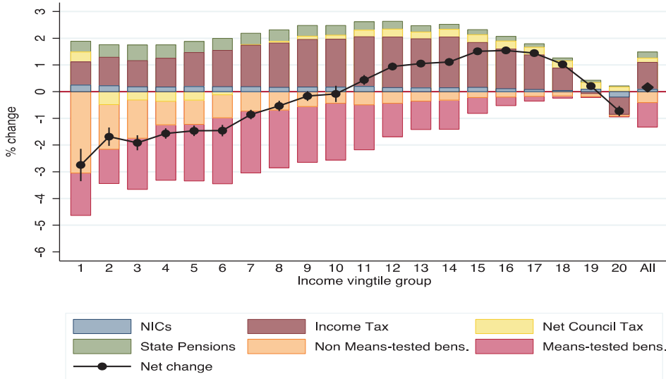
Figure 2: The combined impact of direct tax and cash transfers was mostly regressive, moving incomes from poorer households to those that were better off.

Figures show percentage change in household disposable income by income group due to policy changes, compared with May 2010 system uprated by CPI.